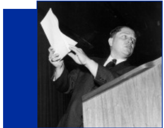
General President James R. Hoffa holds part of the National Master Freight Agreement which was signed in February, 1964